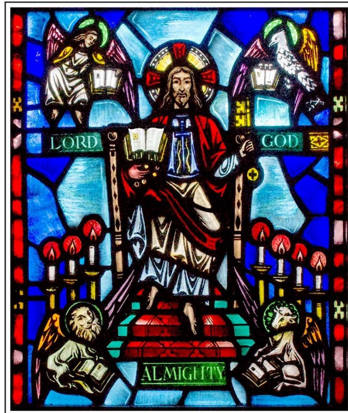
Christ in Glory (north transept vestibule)