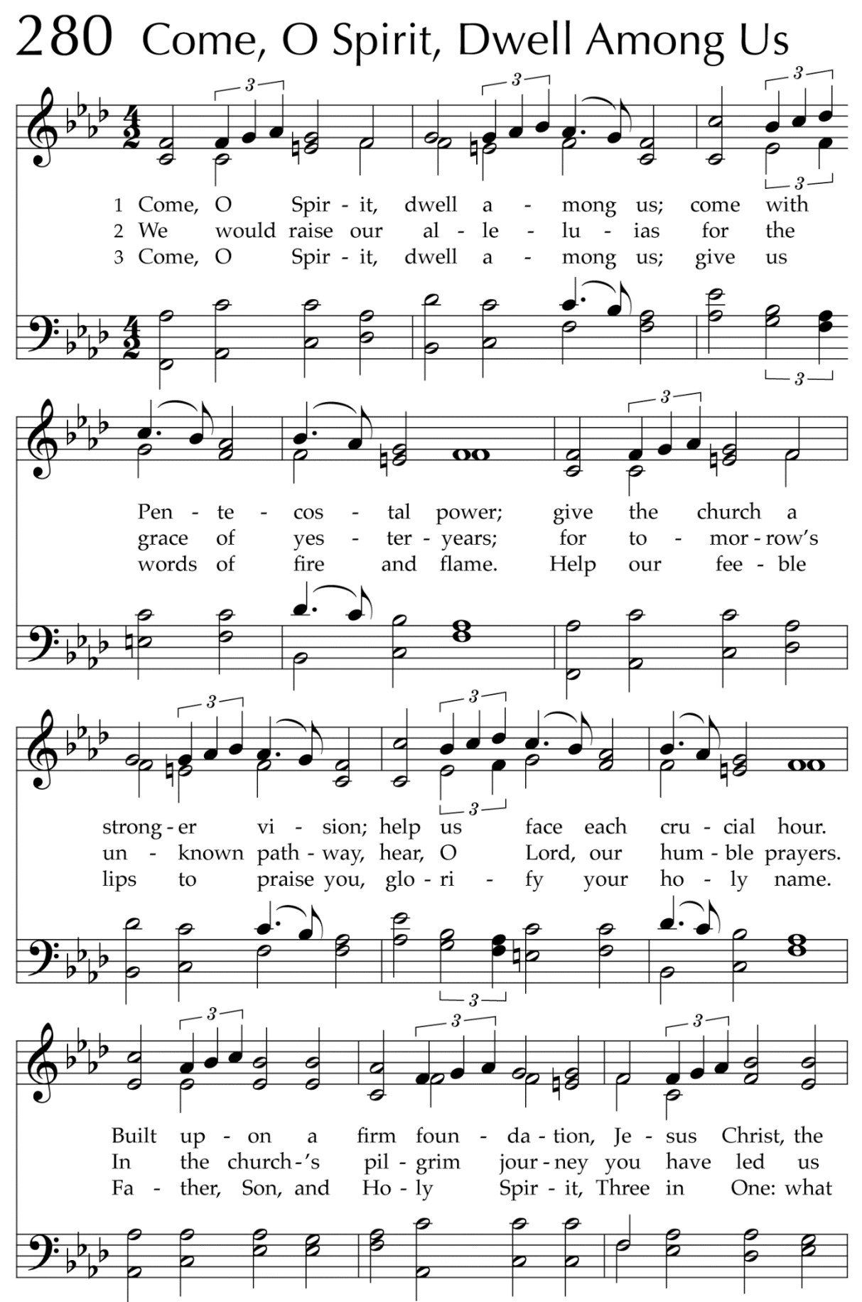
This 20th-century text was written by a Presbyterian layperson and poet, who in her later years became interested in writing hymns for the seasons of the church year and prepared a collection of them for her congregation. It pairs effectively with this sturdy Welsh tune.